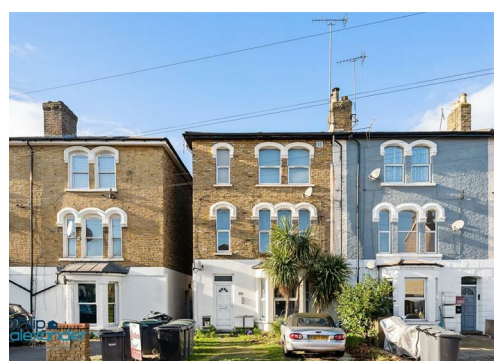
33 Hornsey Park Road, London N8